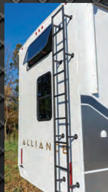
Oversized aluminum ladder