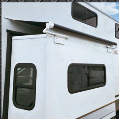
Slide topper awnings