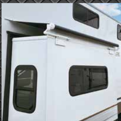
Slide topper awnings