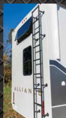
Oversized aluminum ladder