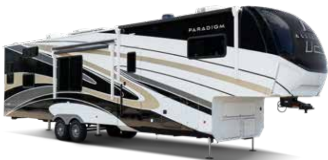
Full Body Paint Option Gold