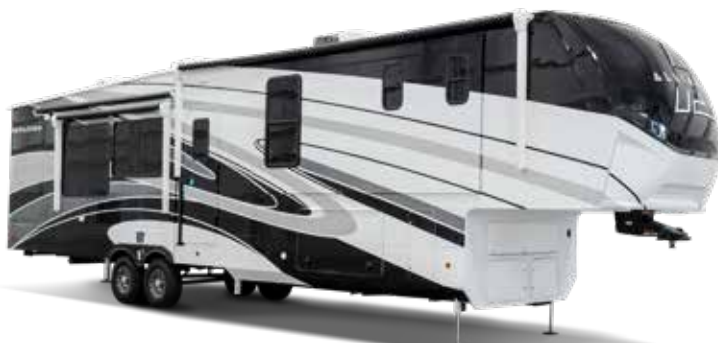
Full Body Paint Option Black