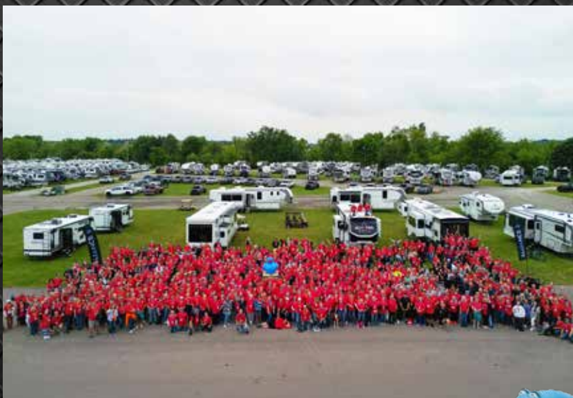
2025 Alliance Owner's Rally / Elkhart, Indiana

We are honored you have taken the time to learn more about Alliance RV and look forward to your feedback and support as we execute our vision. If you are as obsessed with building a better RV ownership experience as we are, this is only the beginning of a very rewarding long-term 'Alliance'.