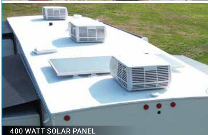
400 WATT SOLAR PANEL