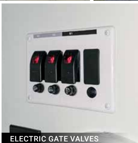
ELECTRIC GATE VALVES