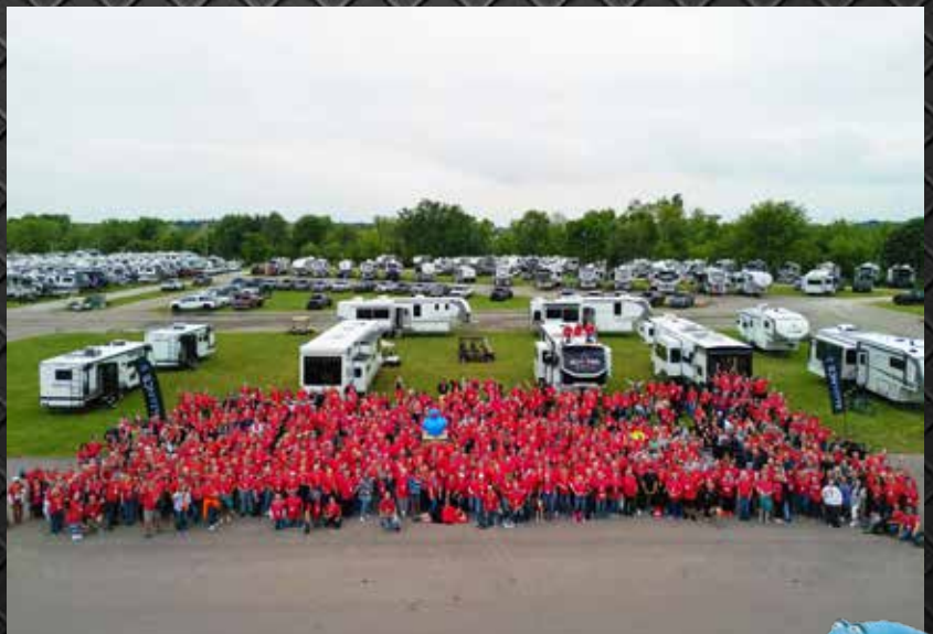
2025 Alliance Owner's Rally / Elkhart, Indiana

We are honored you have taken the time to learn more about Alliance RV and look forward to your feedback and support as we execute our vision. If you are as obsessed with building a better RV ownership experience as we are, this is only the beginning of a very rewarding long-term 'Alliance'.