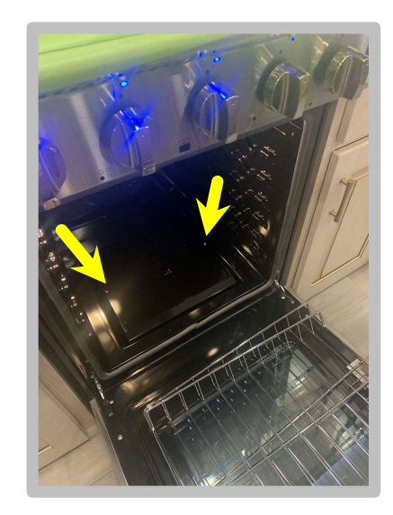
Loosen the two screws as noted above and remove bottom plate inside oven.

(Adjusting the Air Flap Opening for Optimal Performance)