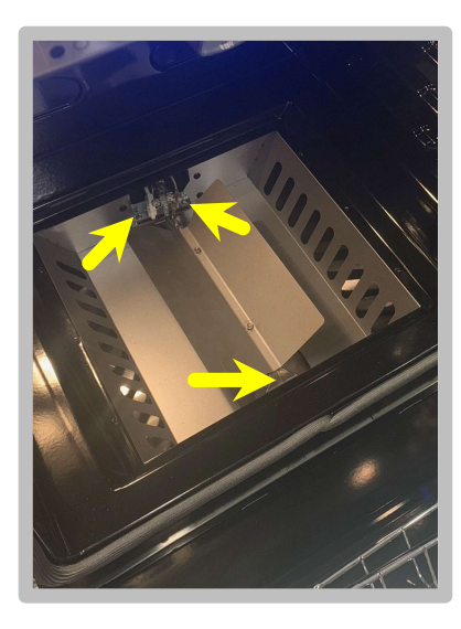
Loosen 3 screws as noted above and remove bottom burner tube.